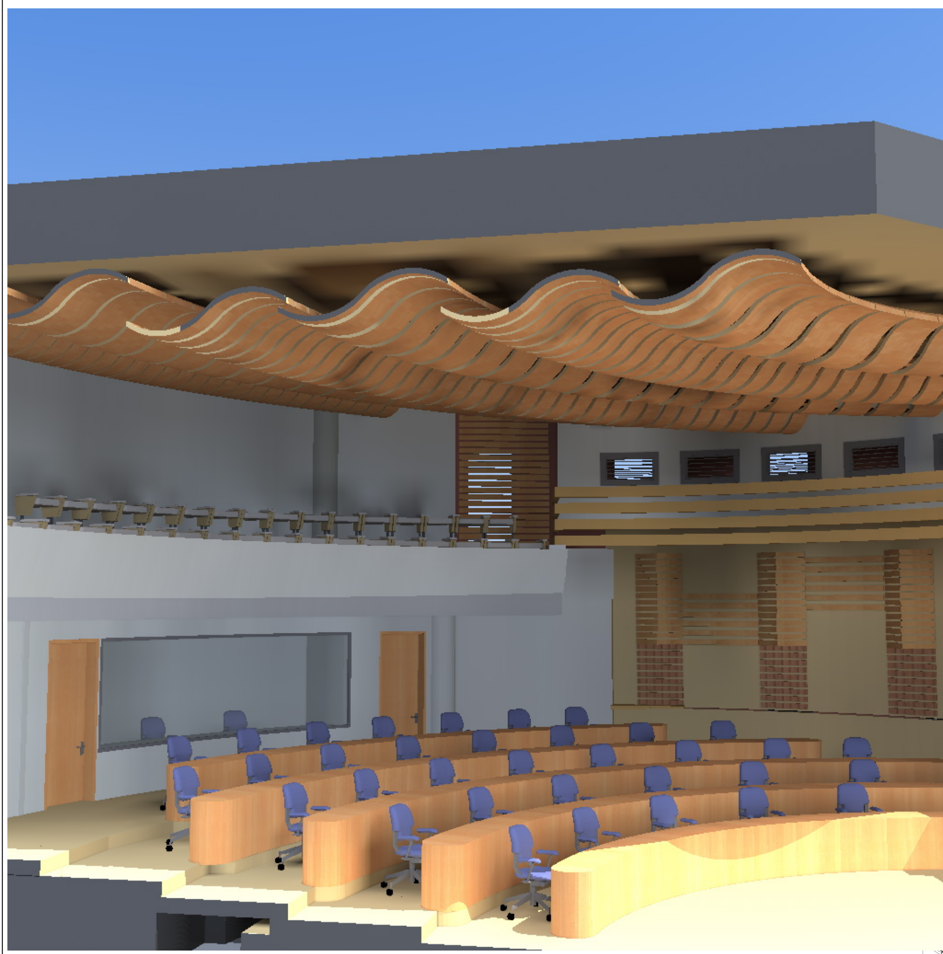
Hemiciclo-B- Interior -1